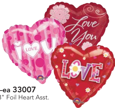
1-ea 33007 18" Foil Heart Asst.