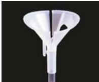
1-ea CC107 MaxiCup II™ Balloon Cup