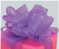
972098 #9 Sheer Ribbon- Purple