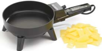
01569 OASIS® Glue Pan