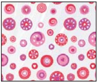
CW6448 Cello Roll- Very Valentine