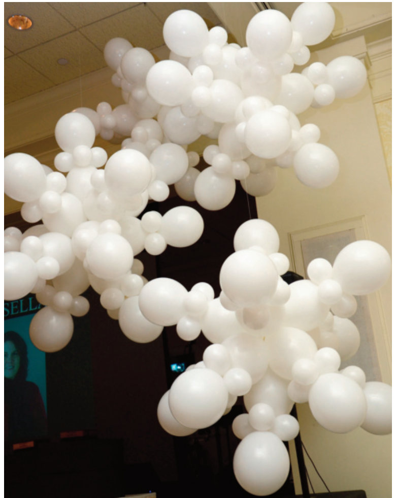
Make a beautiful winter arch perfect for a Frozen themed party!

Wrap the small four-balloon clusters between the 11" balloon and the linking balloons. This balloon cluster will tighten up the snowflake arm.