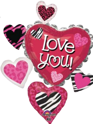
1-ea 46383-36 34" Foil