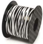
BZ3401 Curling Ribbon -Zebra