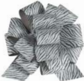
9716232 #16 Pull Bow -Zebra