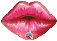
1-ea 22046-19 14" Pre-inflated Foil