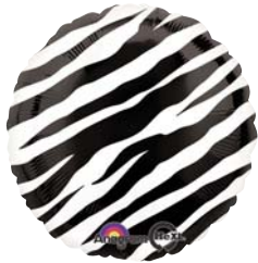
2-ea 45070-18 17" Zebra Foil