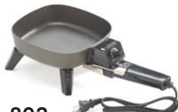
802 SUREBONDER® Glue Skillet