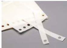
2-ea 94291 Clik-Clik™ Adhesive Strips