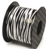
BZ3401 Curling Ribbon -Zebra