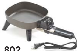
802 SUREBONDER® Glue Skillet