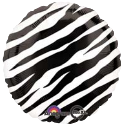
1-ea 45070-18 17" Zebra Foil