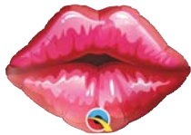
1-ea 22046-19 14" Pre-inflated Foil