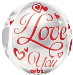
1- ea 46885-18 16" Orbz™ Balloon