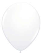
8- ea Q-05-28 5" Qualatex® -White