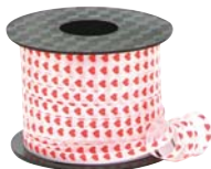
HT3401 Curling Ribbon -Hearts