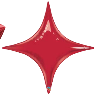
1- ea 22030-18 20" Starpoint Foil -Red