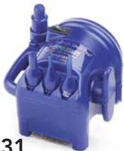
831 Mini Cool Aire® Dual Pro™ Inflator