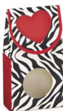
137862 Candy Box -Zebra