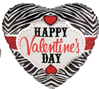
1-ea 61412-18 18" Foil