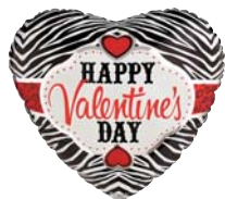
1-ea 61412-19 9" Pre-inflated Foil