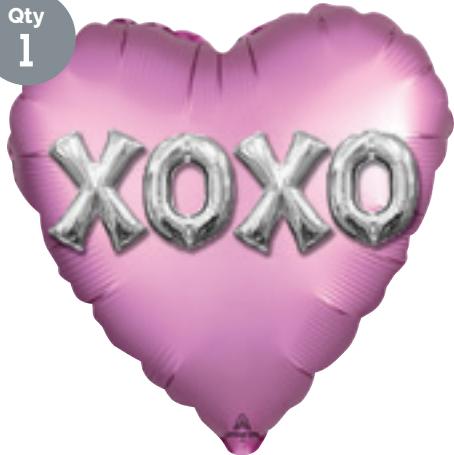
18" Standard Balloon Product #49307-18