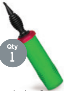
Qualatex® Hand Inflator Product #HI795