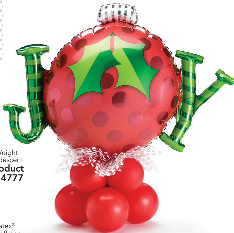
Qualatex® Hand Inflator Product #HI795