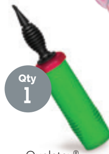
Qualatex® Hand Inflator Product #HI795