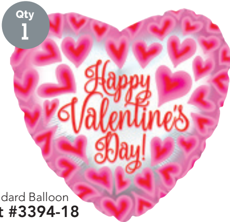
18" Standard Balloon Product #3394-18