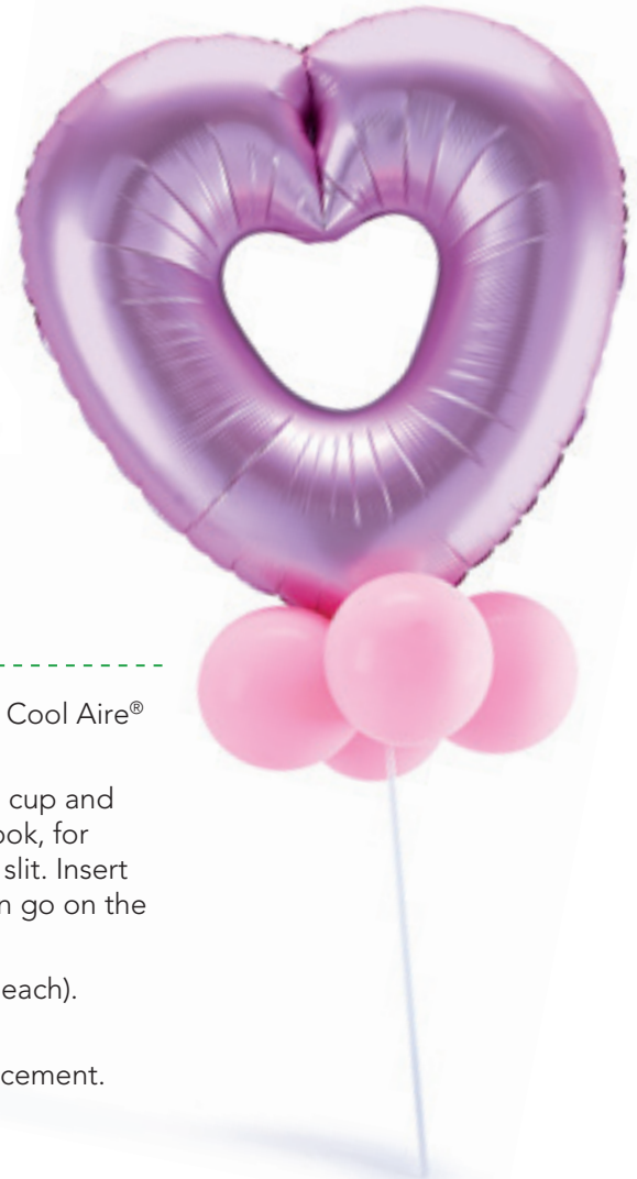
Qualatex® Hand Inflator Product #HI795