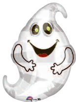
1176 18" Foil Balloon