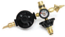
BR74HG Dual Foil + Latex Inflator

Air-fill two 5" black balloons to 4 inches and tie together to form a duplet. Air-fill another identical duplet and twist the two sets together to form a four balloon cluster. Repeat the steps above to create a total of two 5" balloon clusters. Air-fill one of the metallic orange MagicArch™ balloons.