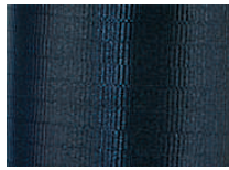
B31626 Black Curling Ribbon