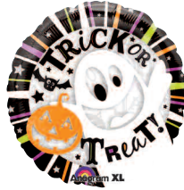
44442-26 26" See-Thru™ Balloon