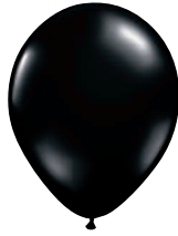
Q0541 8-ea Black 5" Latex