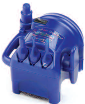
831 Mini Cool Aire® Dual Pro™ Inflator