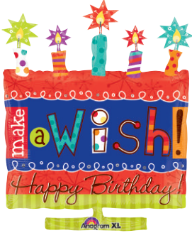
44436-26 1-36" Foil Balloon