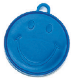
W21 Heavy Weights™