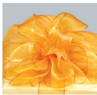
9709608 Orange Sheer Ribbon