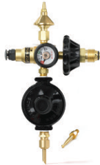
BR74HG Dual Foil + Latex Regulator