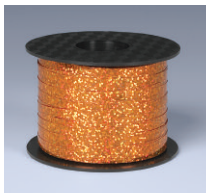
D31616 Orange Holographic Ribbon