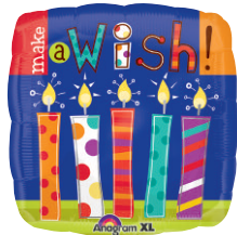
44435-18 1-18" Foil Balloon