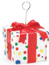
50914 Photo Holder