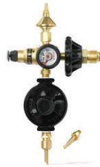
BR74HG Dual Foil + Latex Regulator