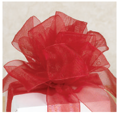
972103 3-yds Red Sheer Ribbon