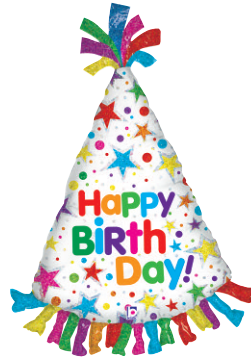
77044-36 1-36" Foil Balloon