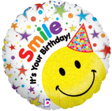
77045-18 1-18" Foil Balloon