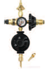
BR74HG Dual Foil + Latex Regulator