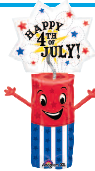
44183-36 5-ea 4th of July 36" foil balloon