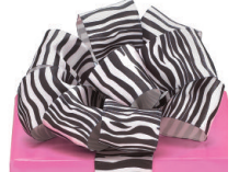
9712004 Zebra Ribbon