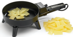
01569 Glue Pan