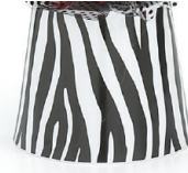
0515304 1-Zebra Container