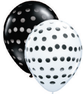
111603 1-ea Polka Dot Latex Balloon