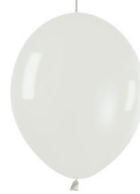
Q26041 1-Clear Link-O-Loon® Balloon