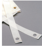
94291 2-ea Adhesive Tabs