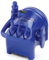
831 Mini Cool Aire® Dual Pro™ Inflator