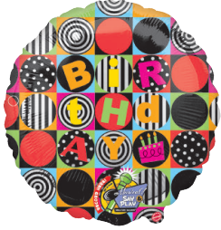
5797-36 1-36" Sing-a Tune® Foil Balloon