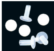
MB101 1-ea Mini Bases