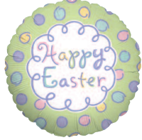
080909 1-ea 9" foil balloon