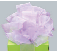
972097 Wired Sheer Fabric Ribbon