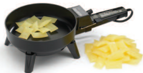
01569 Glue Pan