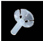
CC101 1-ea Cello Cup