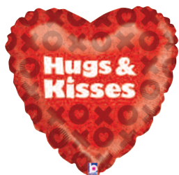
7702118 2-ea 18" Foil Balloons