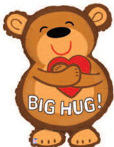
77022-26 1-ea 28" Foil Balloon