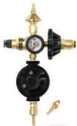
BR74HG Dual Foil + Latex Inflator