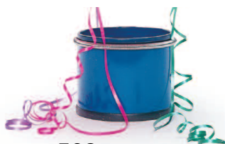
503 Balloon Holder