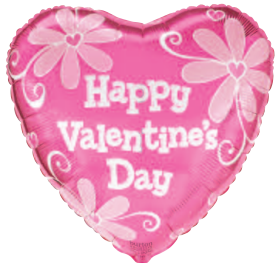
0546-18 3-ea 18" Foil Balloon