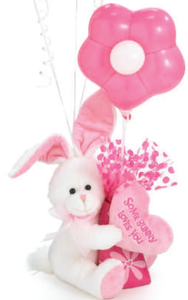
01560 Glue Pillows