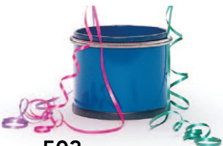
503 Balloon Holder