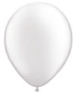
Q-05-28 2-ea 5" White Latex Balloons