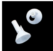
EC202 Erecto Cup