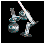
MB101 Mini Bases and Tape