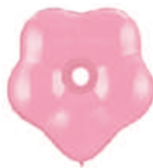
Q-06-15F Geo Blossom