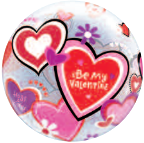
255426 9-ea Bubbles™ Balloon