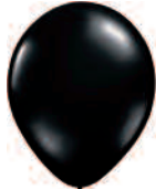
Q0541 40-ea 5" Black Latex Balloon