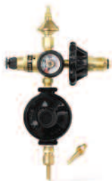
BR74HG Dual Foil + Latex Inflator