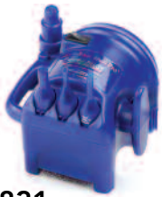
831 Mini Cool Aire® Dual Pro™ Inflator