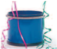
503 Balloon Holder