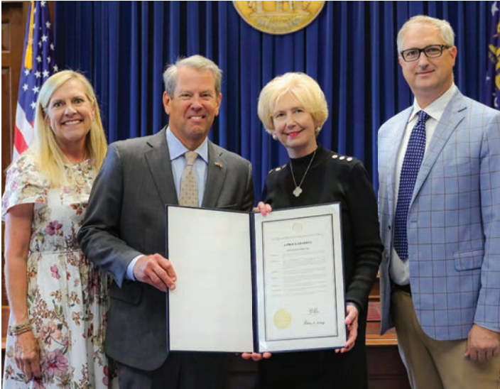
Georgia Governor Brian Kemp proclaims September 2025 Balloon Month in Georgia