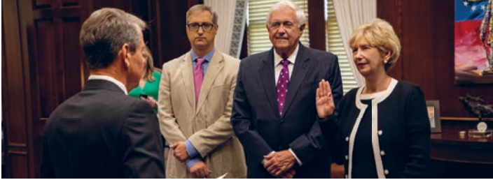
Maxine appointed to Board of Governors for Georgia World Congress Center Authority by Governor Brian Kemp