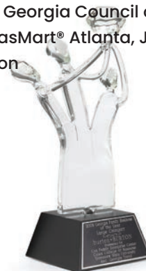
2008 Georgia Family Business of the Year Award from Cox Family Enterprise Center