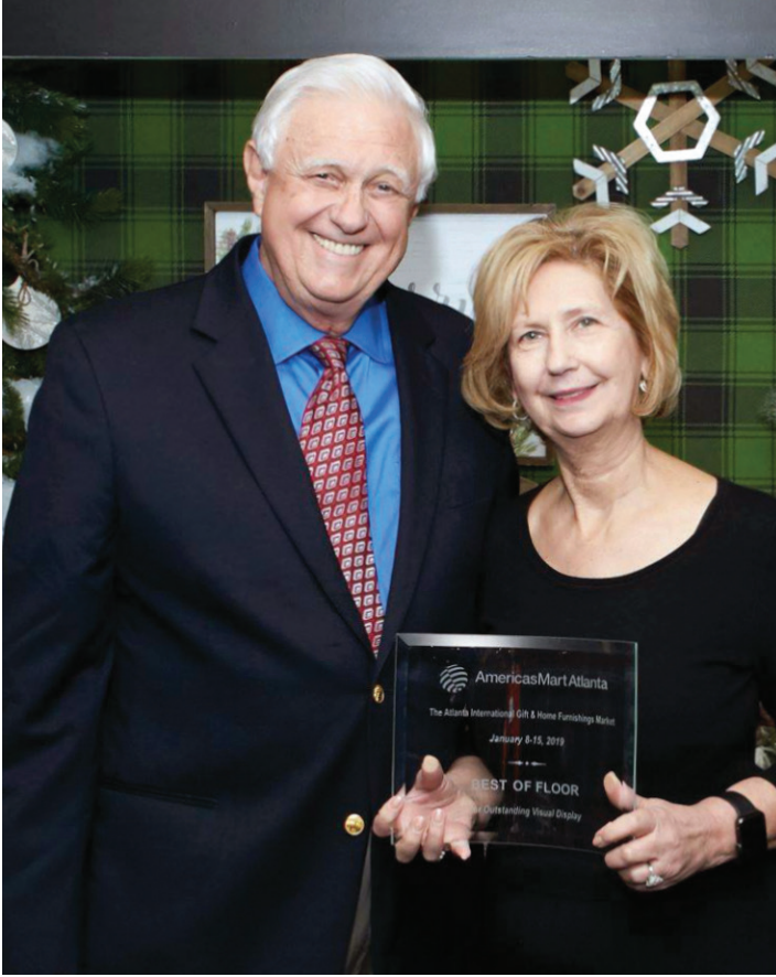
Best of Floor for Outstanding Visual Display Award at AmericasMart® Atlanta, January 2019