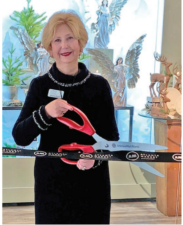
Ribbon cutting for new and expanded showroom at AmericasMart® Atlanta, January 2022