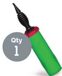
Qty 1 Hand Inflator Product #HI795