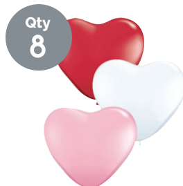
Qty 8 6" Sweetheart Asst. Product #6H00