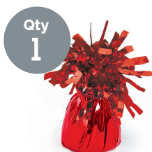
Qty 1 Weight-Red Product #14773