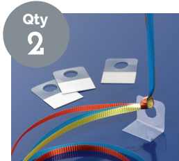
Qty 2 Adhesive Grip Tabs Product #32081A