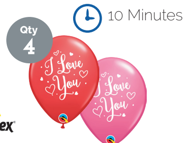
Qty 4 11" ILY Hearts Product #11-5246