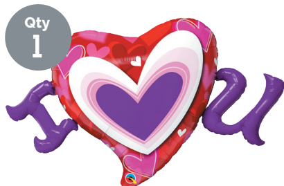
Qty 1 46" I Heart You Product #22642-36