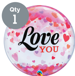
Qty 1 22" Love You Bubble Product #22645-26