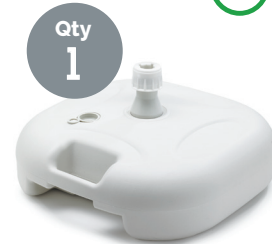
Qty 1 Base-Arch/Column Product #83002