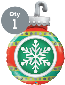
Qty 1 35" Snowflake Ornament Product #22579-36