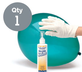
Qty 1 Balloon Shine™ Product #00119