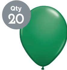
Qty 20 11" Green Product #Q-11-22