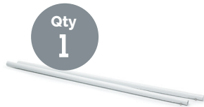
Qty 1 Extension Pole Product #83003