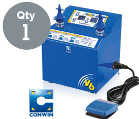
Qty 1 Precision Air™ V6 Inflator Product #83601