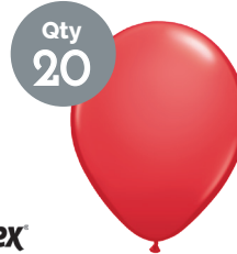
Qty 20 11" Red Product #Q-11-23