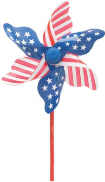
9715553 Pinwheel Picks Plastic and wood. 11" Tall • 4"H x 4"W x 2"D $24.48 pk/24. $1.02 ea Qty Ordered _____