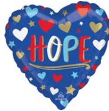
Preinflated 9"-40378-19 Includes cup and stick. 1.66 Order in multiples of 10. Qty Ordered _____