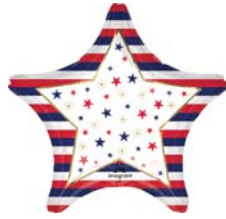
Preinflated 9"-4939-19 Includes cup and stick. 1.66 Order in multiples of 10. Qty Ordered _____