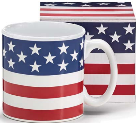
9725508 Mugs Ceramic. 13 oz $21.72 set/6. $3.62 ea Qty Ordered _____