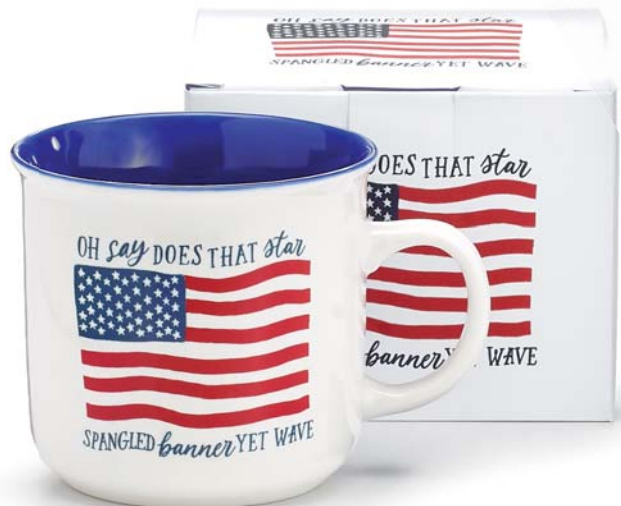
9748865 Mugs Ceramic. 14 oz $40.44 set/12. $3.37 ea Qty Ordered _____

burton ® +BURTON the TOTAL gift experience ®