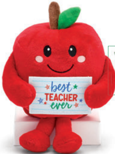
NEW 3184-93 Plush Fabric. Ribbon loop. 11" High $42.60 set/6. $7.10 ea Qty Ordered _____