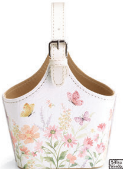
NEW 9753193 Planters Faux leather, fabric, heavy paperboard, and metal. PVC liners. 9½"H x 6½"W x 5"D $56.79 set/9. $6.31 ea Qty Ordered _____