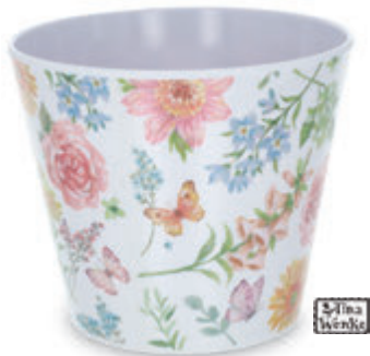
3154-303 #4 Pot Covers Melamine. Food safe. 4½"H x 5" Opening $15.48 set/12. $1.29 ea Qty Ordered _____