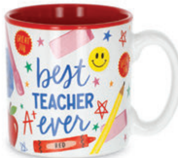
NEW 3184-00 Mugs Ceramic. 13 oz $23.34 set/6. $3.89 ea Qty Ordered _____