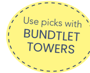
NEW 3184-144 Pick Asst. Wood. Clip. 12" Tall 3"H x 2¼"W • 3½"H x 2¾"W $24.48 pk/24. $1.02 ea Qty Ordered _____