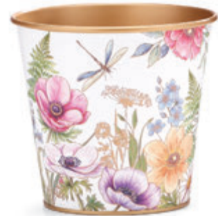
NEW 9753351 #4 Pot Covers Tin. PVC liners. 4¾"H x 4¾" Opening $34.80 set/12. $2.90 ea Qty Ordered _____