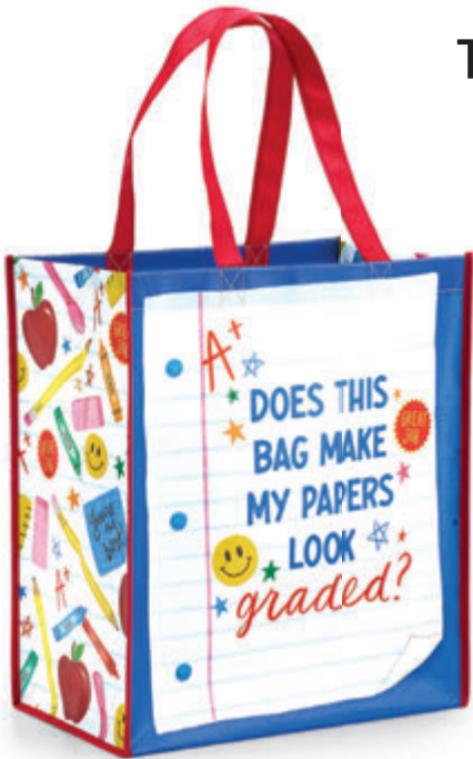
NEW 3184-41 Tote Bags Polypropylene. 15"H x 13"W x 8" Gusset $19.20 set/12. $1.60 ea Qty Ordered _____