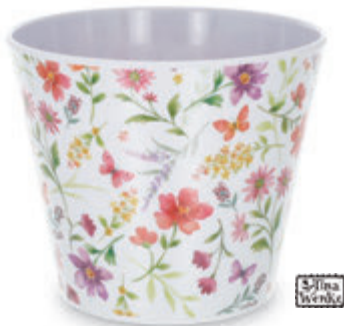
NEW 3190-303 #4 Pot Covers Melamine. Food safe. 4½"H x 5" Opening $15.48 set/12. $1.29 ea Qty Ordered _____