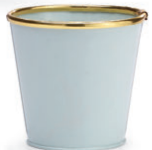
NEW 9751679 #4 Pot Cover Asst. Hand-painted tin. Watertight. 5"H x 5" Opening $21.30 set/10. $2.13 ea. Qty Ordered _____

Customer #: _____ Store #: _____ Phone #: _____ Contact Name: _____