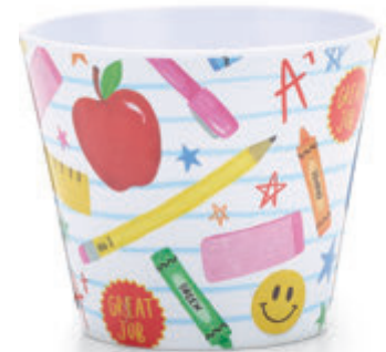
NEW 3184-303 #4 Pot Covers Melamine. Food safe. 4½"H x 5" Opening $15.48 set/12. $1.29 ea Qty Ordered _____