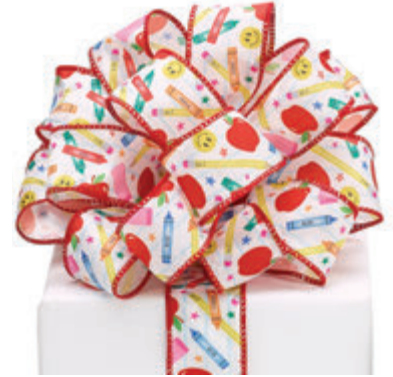
NEW 3184-203 #9 Ribbon Wired edge. 1½" Wide x 20 yd $9.96 roll Qty Ordered _____