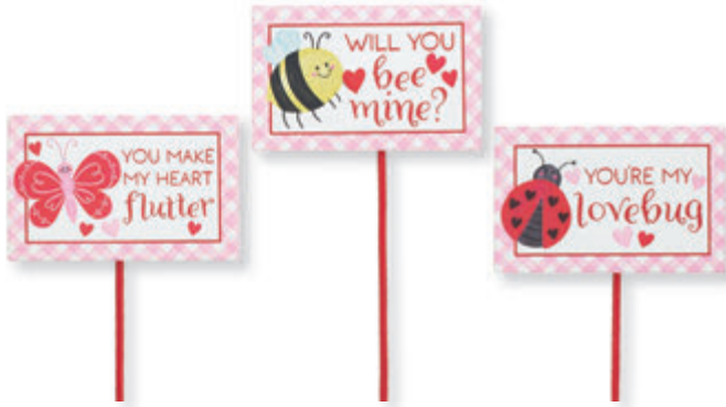
NEW 9752952 Pick Asst. Wood. Clip. 12" Tall • 2"H x 3"W $24.48 pk/24. $1.02 ea Qty Ordered _____