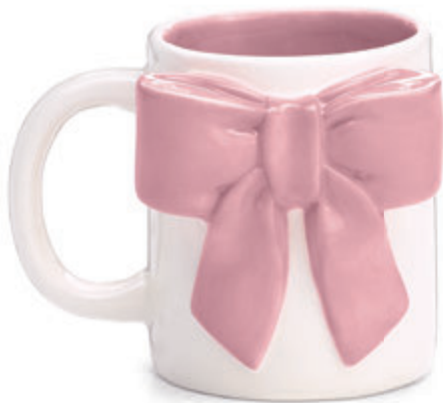
9751808 Mugs Hand-painted ceramic. 18 oz $43.38 set/6. $7.23 ea Qty Ordered _____