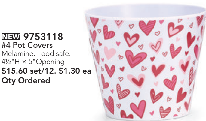
NEW 9753118 #4 Pot Covers Melamine. Food safe. 4½"H x 5" Opening $15.60 set/12. $1.30 ea Qty Ordered _____