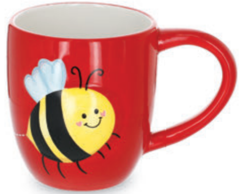
NEW 9752887 Mugs Raised ceramic. 15 oz $34.08 set/6. $5.68 ea Qty Ordered _____