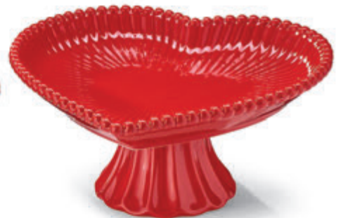
NEW 9753301 Cake Pedestals Hand-painted raised ceramic. 4½"H x 10¼"W x 10¼"D $62.08 set/4. $15.52 ea Will hold an 8" Bundt Cake. Qty Ordered _____

burton +BURTON the TOTAL gift experience®