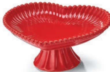
NEW 9753302 Cake Pedestals Hand-painted raised ceramic. 3½"H x 8½"W x 8½"D $41.36 set/4. $10.34 ea Qty Ordered _____