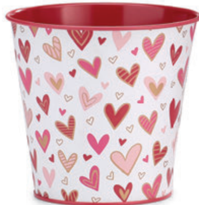
NEW 9752917 #4 Pot Covers Printed tin. PVC liners. 4¾"H x 4¾" Opening $31.56 set/12. $2.63 ea Qty Ordered _____