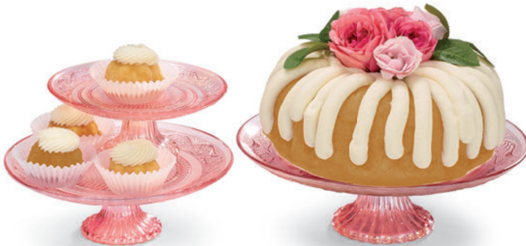
9743698 Cake Pedestal Asst. Pressed raised glass. Iridescent. 3"H × 7"Diameter • 3½"H × 9"Diameter • 3¾"H × 11"Diameter $37.26 set/3. Qty Ordered _____

burton +BURTON the TOTAL gift experience®