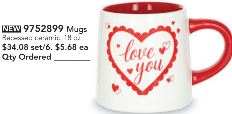
NEW 9752899 Mugs Recessed ceramic. 18 oz $34.08 set/6. $5.68 ea Qty Ordered _____