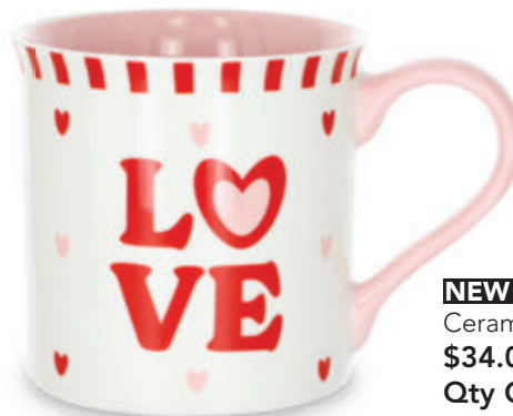
NEW 9752901 Mugs Ceramic. 14 oz $34.08 set/6. $5.68 ea Qty Ordered _____