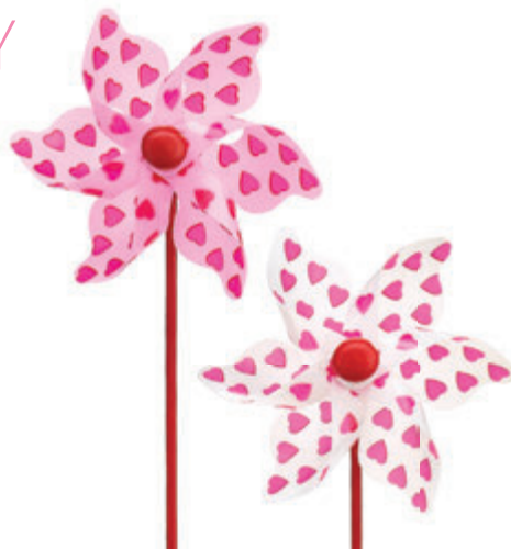
NEW 9753101 Pick Asst. Plastic and wood. 11" Tall 3½"H × 3½"W × 2"D $24.48 pk/24. $1.02 ea Qty Ordered _____