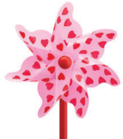
NEW 9753102 Picks Plastic and wood. 12½" Tall 5½"H × 5½"W × 3"D $21.36 pk/12. $1.78 ea Qty Ordered _____