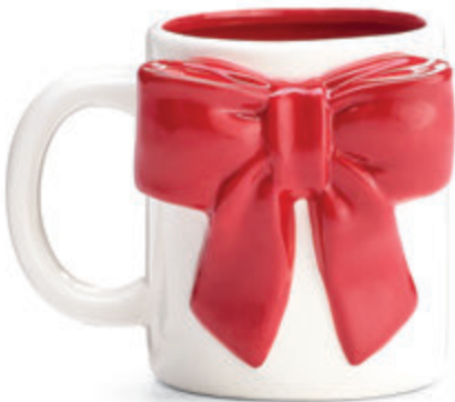
NEW 9752884 Mugs Hand-painted ceramic. 18 oz $43.38 set/6. $7.23 ea Qty Ordered _____