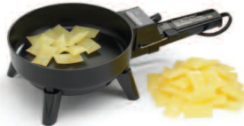
01569 Glue Pan