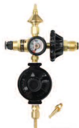
BR74HG Dual Foil + Latex Inflator