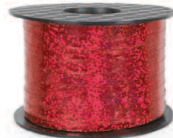
D31613 Red Holographic Curling Ribbon