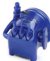
831 Mini Cool Aire® Dual Pro™ Inflator