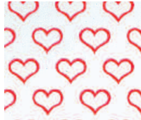
21101 Hearts Cello Sheets