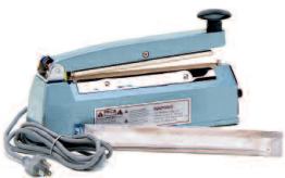
HS870 Heat Sealer