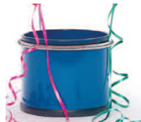
503 Balloon Holder