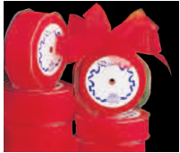
972103 Scarlet Red Sheer Fabric Ribbon