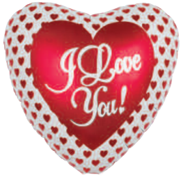
6500-36 1-ea 36" Foil Balloon