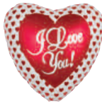
6500-09 1-ea 9" Foil Balloon