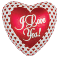
6500-18 1-ea 18" Foil Balloon