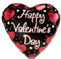
0618-19 1-9" Pre-inflated Foil Vases Balloon with stick