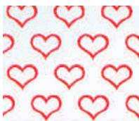
21101 Hearts Cello Sheets