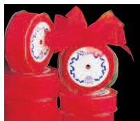
972103 Scarlet Red Sheer Fabric Ribbon