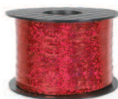
D31613 Red Holographic Curling Ribbon