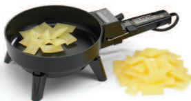
01569 01560 Glue Pan Glue Pillows