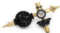
BR74HG Dual Foil + Latex Regulator