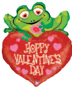
77107-36 1-ea 36" Foil Balloon