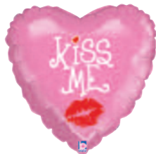
77108-18 3-ea 18" Foil Balloon