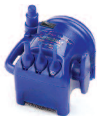
831 Mini Cool Aire® Dual Pro™ Inflator