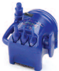
831 Mini Cool Aire® Dual Pro™ Inflator