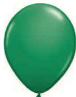
Q-05-22 8-ea Green 5" Qualatex® Balloon