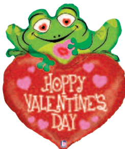
77107-36 1-ea 36" Foil Balloon