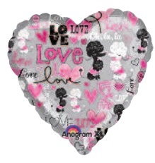
44490-18 2-ea 18" Foil Balloon