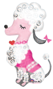
44491-36 1-ea 36" Foil Balloon