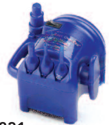
831 Mini Cool Aire® Dual Pro™ Inflator