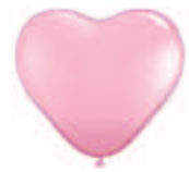
6-H-26 4-ea Pink 6" Qualatex® Heart