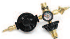
BR74HG Dual Foil + Latex Regulator