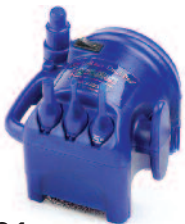
831 Mini Cool Aire® Dual Pro™ Inflator