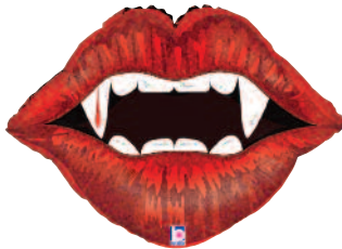
77102-26 1- ea 36" Foil Balloon