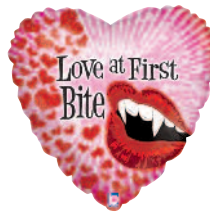
77115-18 6- ea 18" Foil Balloon