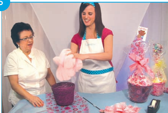
Step 5: Place plush.

Place plush bear head first into container.