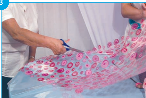
Step 3: Cut cellophane.

Adding decorative cellophane to the bag is optional. A clear bag shows the cubcake more clearly. In this instruction we are adding decorative cellophane for extra color. Cut a sheet about 3½ ft. in length. Cut down the center to make it narrower.