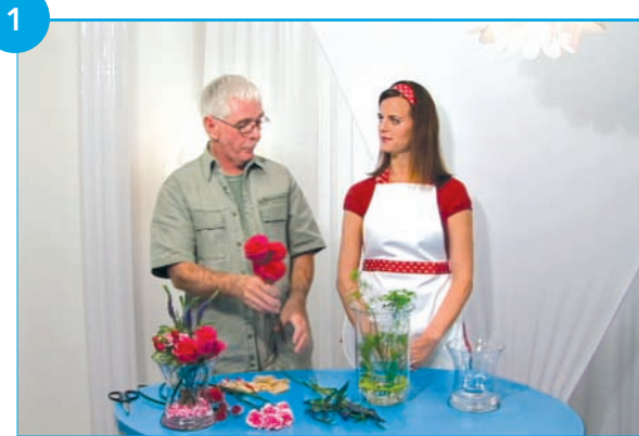
Step 1: Order materials.

981633 10" Double Vase Lily Grass 975565 6" Double Vase Queen Anne's Lace Veronica Green Button Mums Spray Carnations Hypericum