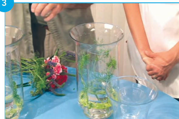
Step 3: Add Queen Anne's Lace.

Fill inside vase + outside vase with about 3" of water. Drop Green Button Mum petals into outside vase + then follow with pinched off Hypericum berries.