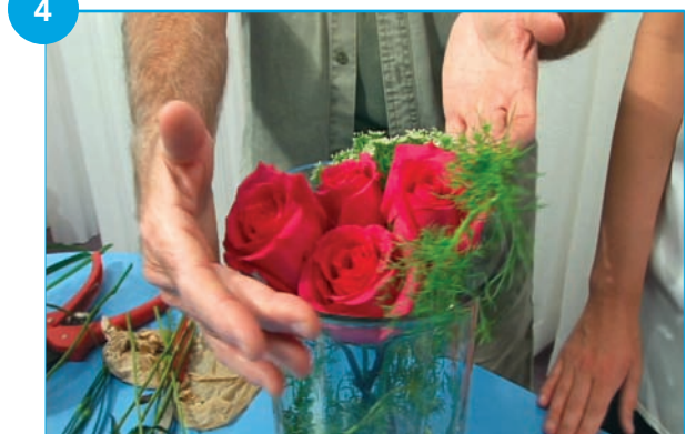
Step 4: Fill with Queen Anne's Lace + Roses.

Stand side shoots of Queen Anne's Lace in outside vase circling the inside vase.