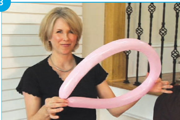
Step 3: Tie ends.

Tie ends of 260Q together to form a loop.