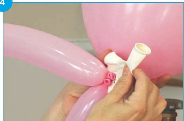
Step 4: Inflate 11" balloon.

Inflate 11" latex balloon + tie off. Insert tail through GEO Blossom®.