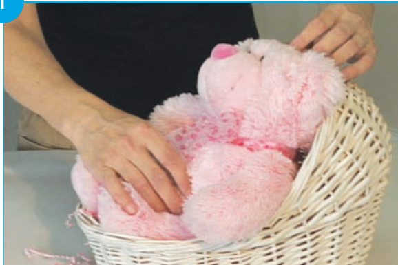
Step 1: Order materials. Add shred + plush.