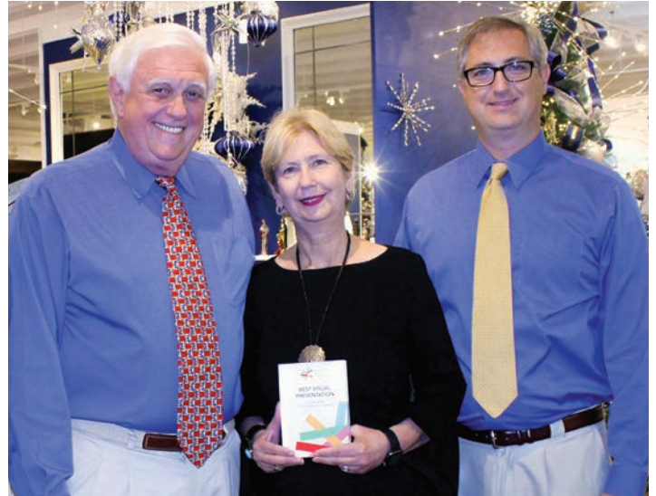
Best Visual Presentation Award at Dallas Market Center SM , June 2021