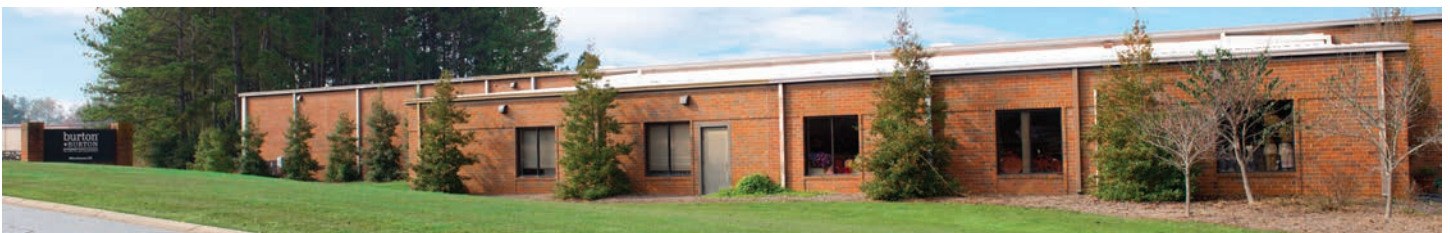
Candy + Packaging + Warehouse