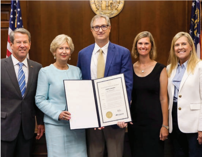
Georgia Governor Brian Kemp proclaims September 2023 Balloon Month in Georgia