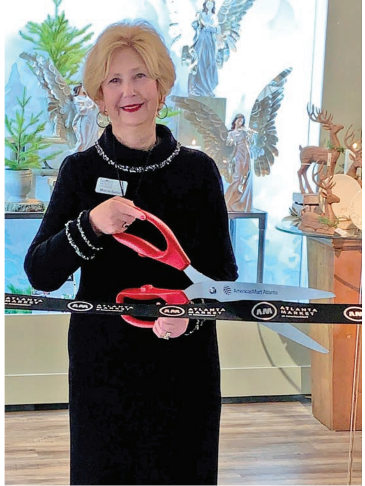
Ribbon cutting for new and expanded showroom at AmericasMart® Atlanta, January 2022