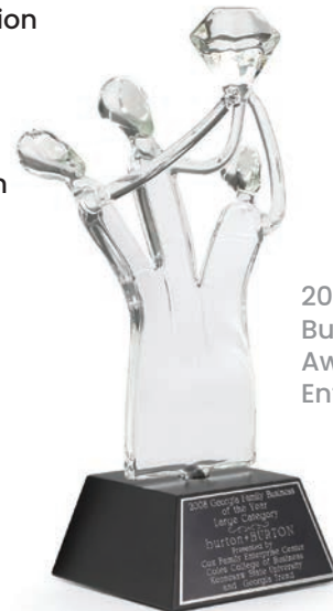
2008 Georgia Family Business of the Year Award from Cox Family Enterprise Center