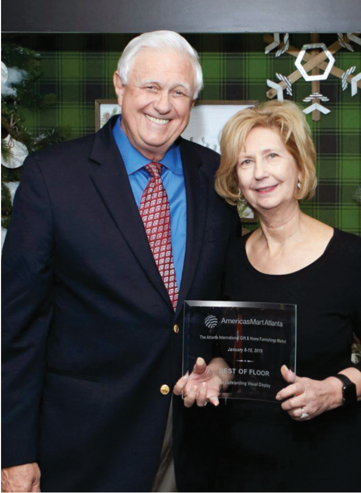
Best of Floor for Outstanding Visual Display Award at AmericasMart® Atlanta, January 2019